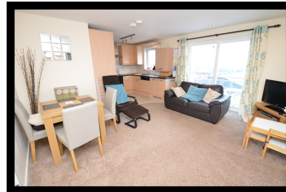
Living / Kitchen / Dining Room