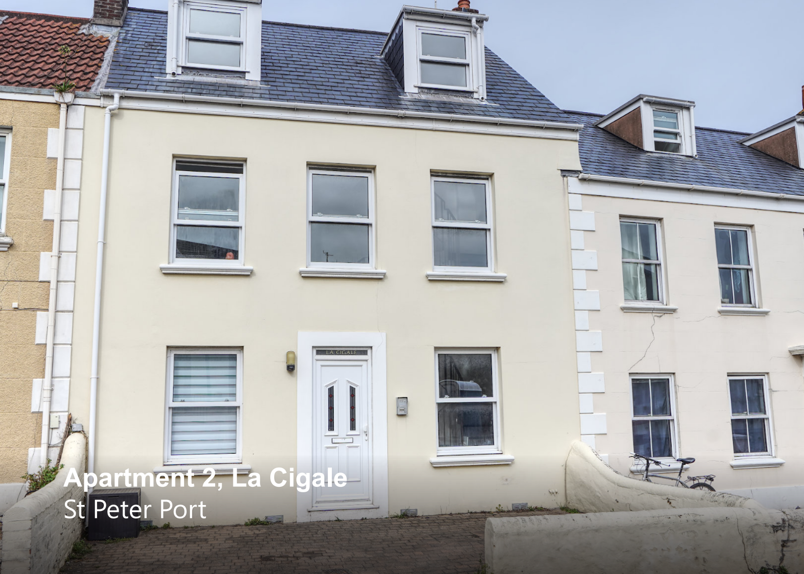
Apartment 2, La Cigale St Peter Port