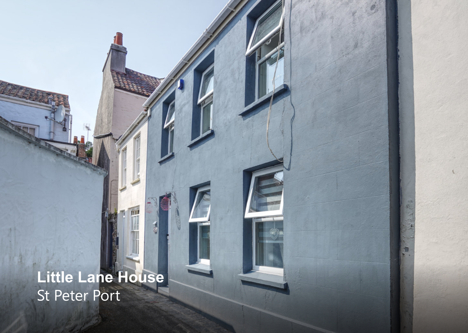
Little Lane House St Peter Port